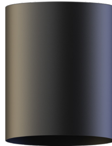
Black Exterior/Black Interior