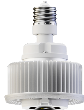
SAD-E39-E26-SHT + VA6 Lamp (Lamp not included)